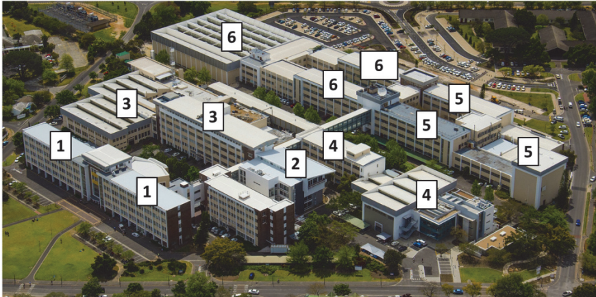
Figure 1.1: The Engineering building complex (the numbers are used in the descriptions below).

The current building complex in Banghoek Road, Stellenbosch, was completed in the seventies and since then it has been expanded from time to time, for example with the addition of the Knowledge Centre in 2012. The figure below indicates an aerial photograph of the current complex.